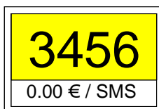
Figure 2: Choice of colours